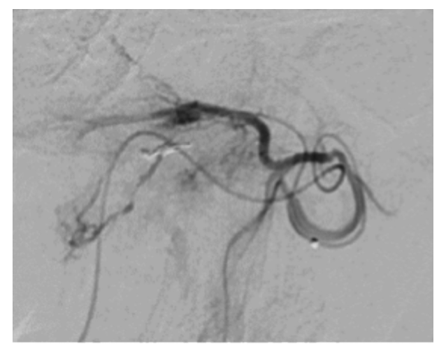
Figure 3: Post-Embolization Angiogram Showed Significant Reduction in Blush

Post procedure angiogram revealed successful embolization with significant tumor blush reduction, see figure 3.